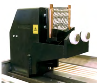
Headstock Steady Rest Part number 20978A1