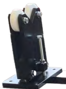
Bed-mounted Movable Steady Rest Part number 20955A3