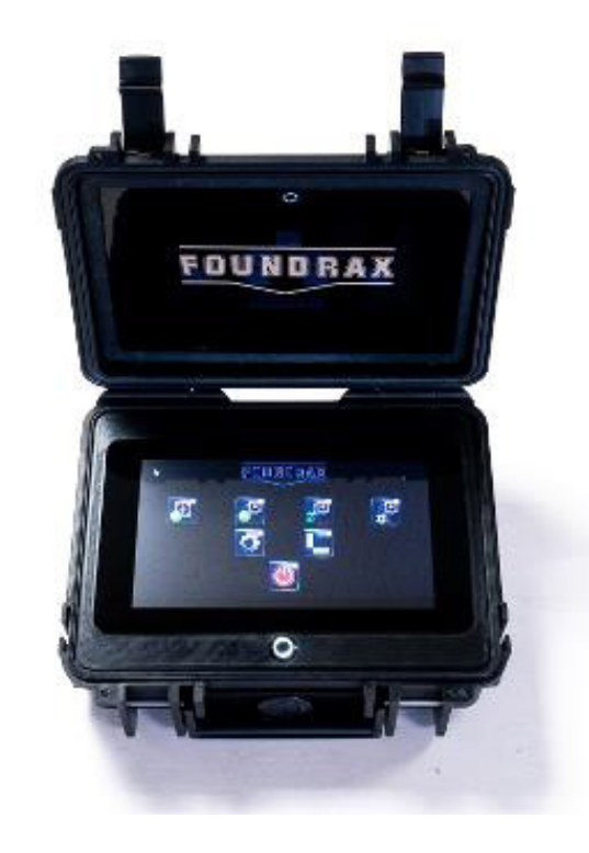
BRINtronic-NEO Rugged, compact, lightweight